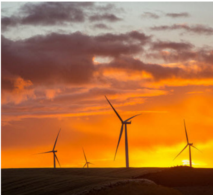
Portland General Electric’s Tucannon River Wind Farm was the first energy project in North America to receive the Institute for Sustainable Infrastructure Envision Gold award

Envision measures sustainable infrastructure projects in five categories: quality of life, leadership, natural world, resource