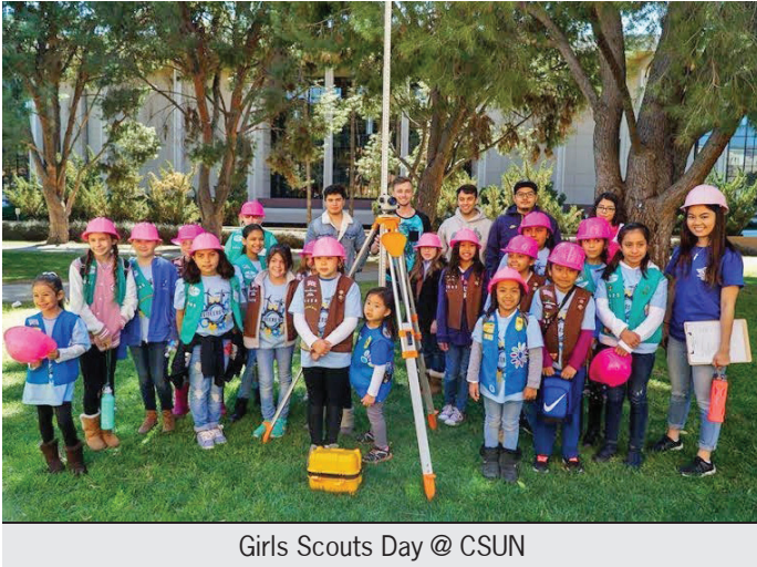
Girls Scouts Day @ CSUN