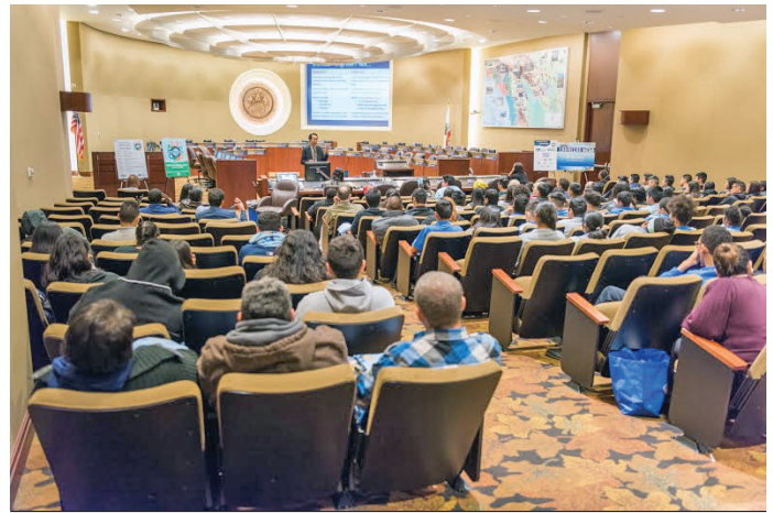
High School Day @ MWD