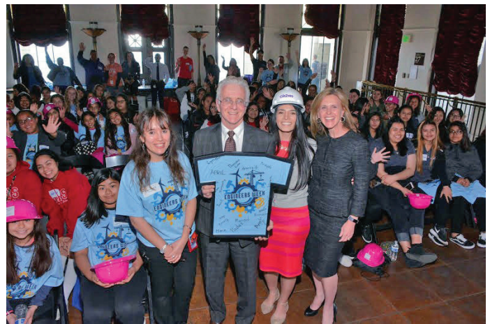
Ladies Day @ LA City Hall