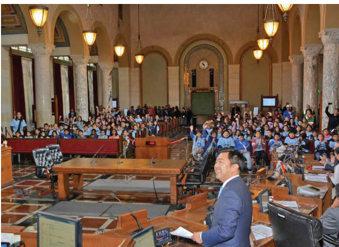
Elementary School Day @ LA City Hall

ASCE American Society of Civil Engineers