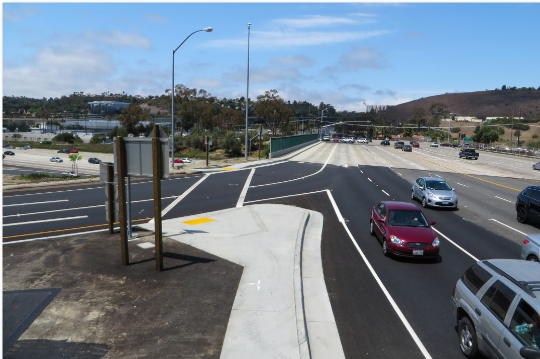
Post-construction looking westerly across widened I-5 bridge overcrossing