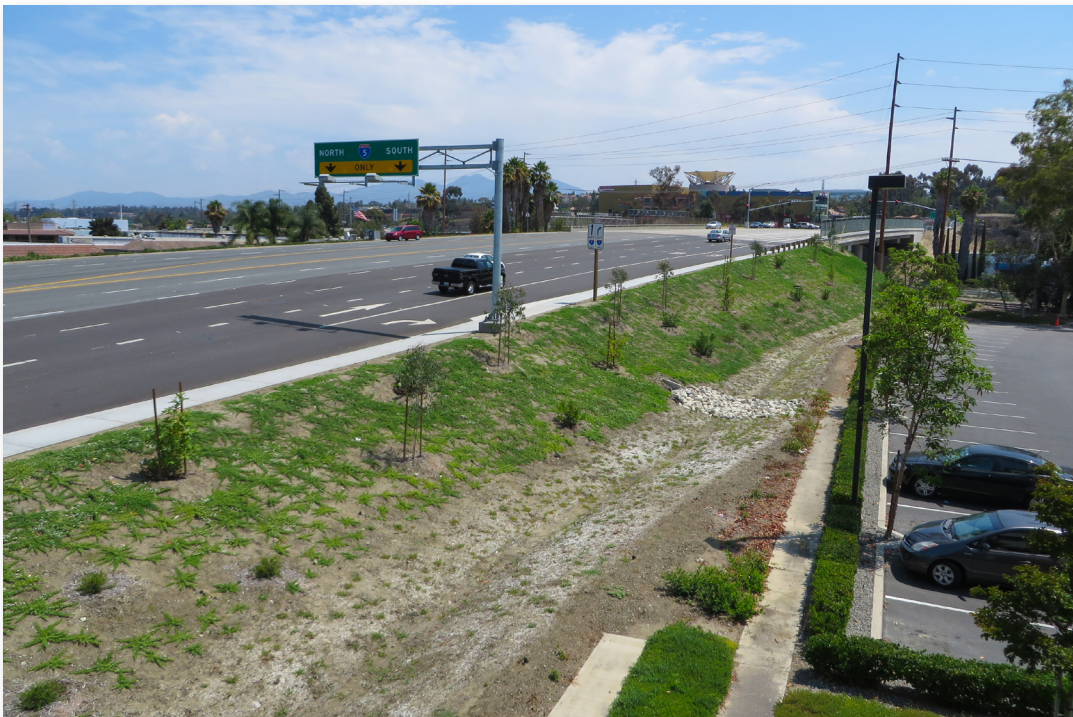
Post-construction looking easterly across widened Crown Valley Parkway