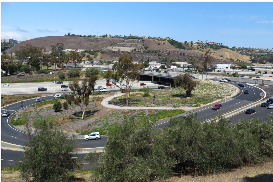
Northeast of I-5 looking northwesterly at northbound I-5 loop entrance ramp