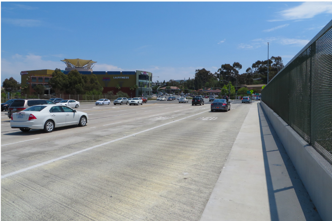
Post-construction looking easterly across I-5 overcrossing bridge