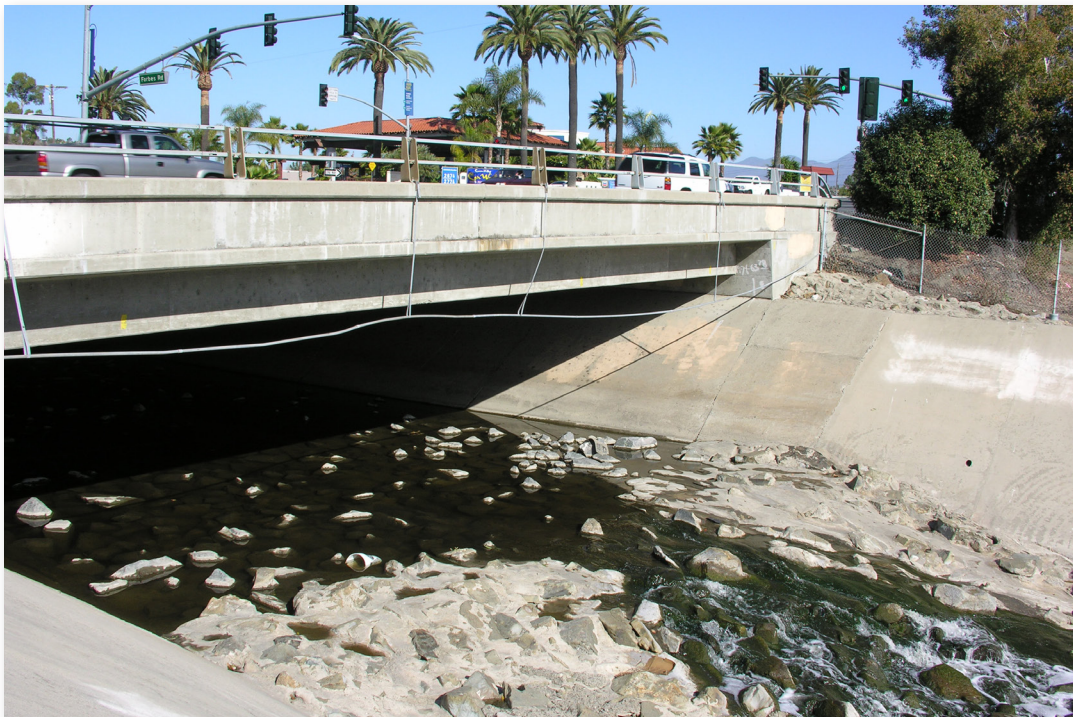
Pre-construction Oso Creek Bridge