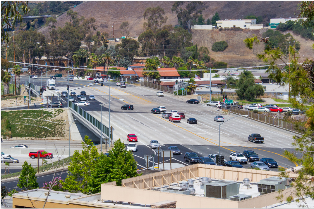
Post-construction looking westerly across widened I-5 bridge overcrossing