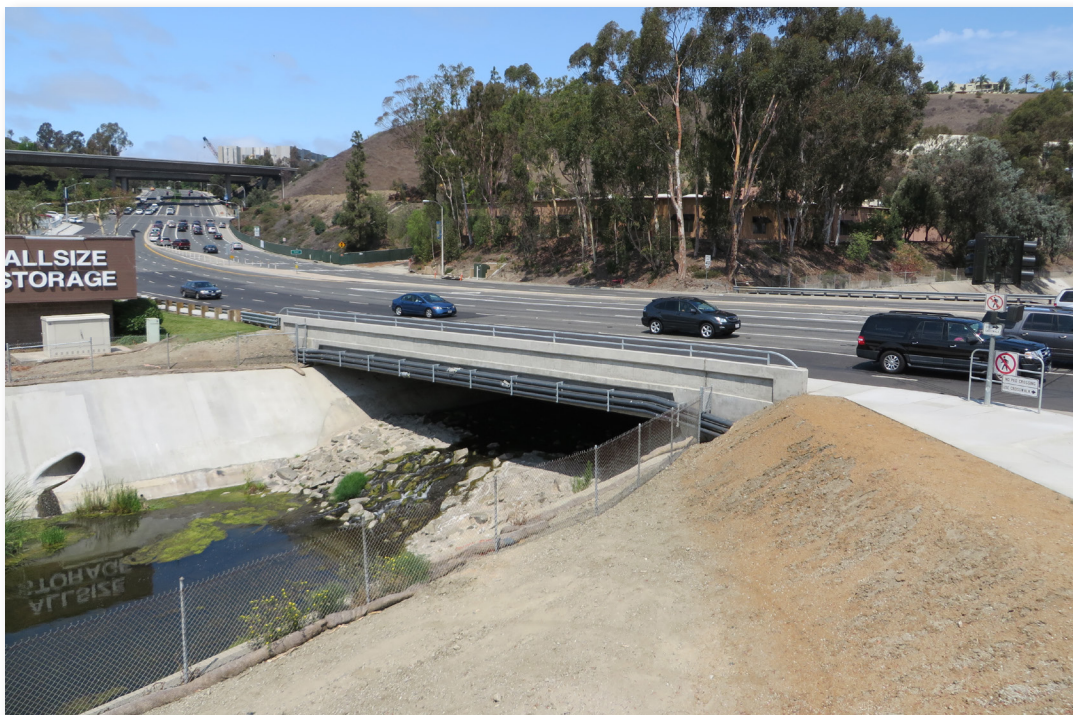
Post-construction Oso Creek Bridge