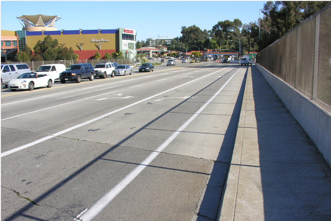
Pre-construction looking easterly across I-5 overcrossing bridge