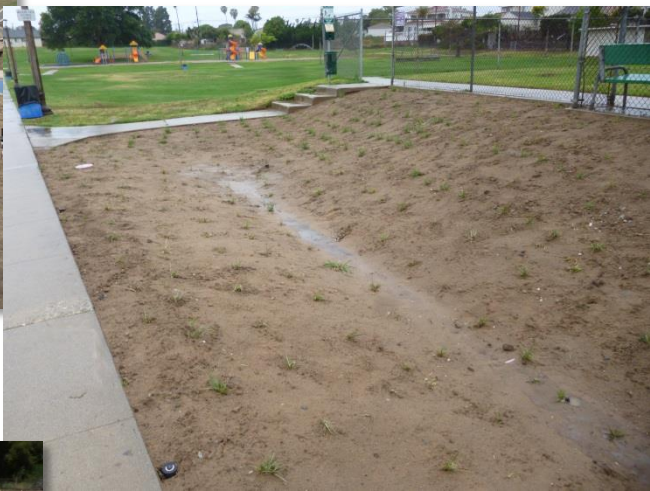
Biofiltration sump constructed at Entradero Basin

Concrete weirs and biofiltration sumps allow stormwater retention, infiltration, and storage for irrigation.