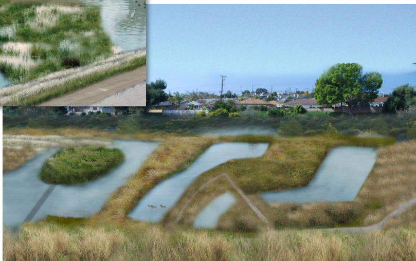
Treatment wetlands at Henrietta Basin