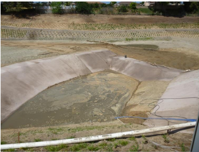
Concrete weir and sumps at Henrietta basin