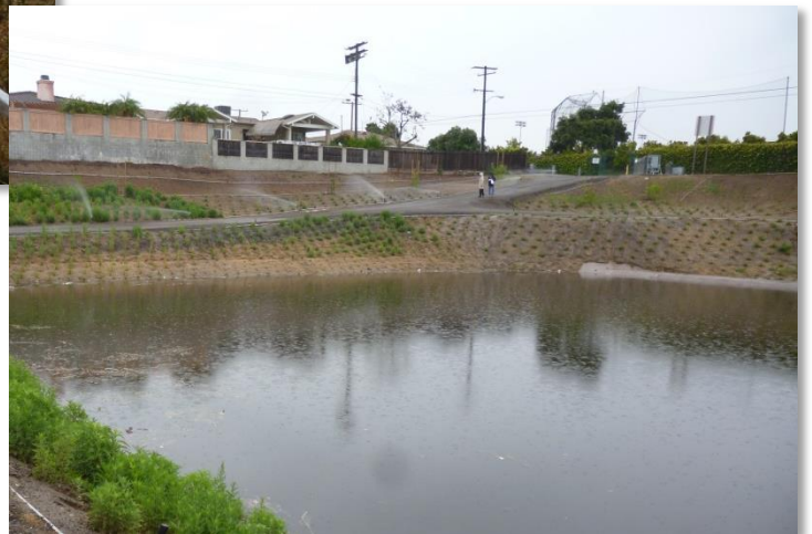
Henrietta Basin after a storm event