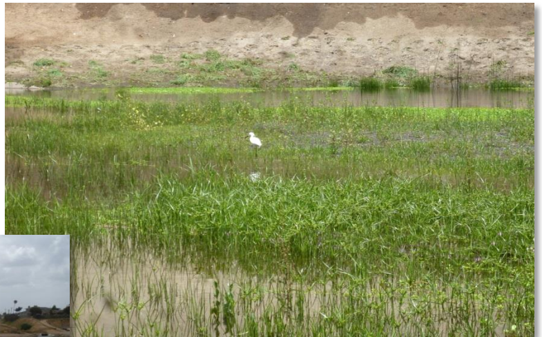
Treatment wetlands at Amie Basin