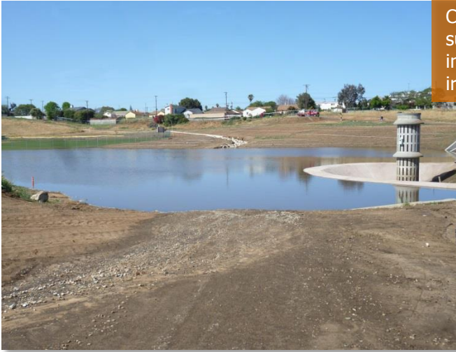
Concrete weir at Entradero Basin

Concrete weirs and biofiltration sumps allow stormwater retention, infiltration, and storage for irrigation.