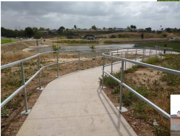
Path leading to the walking trails at Entradero Basin