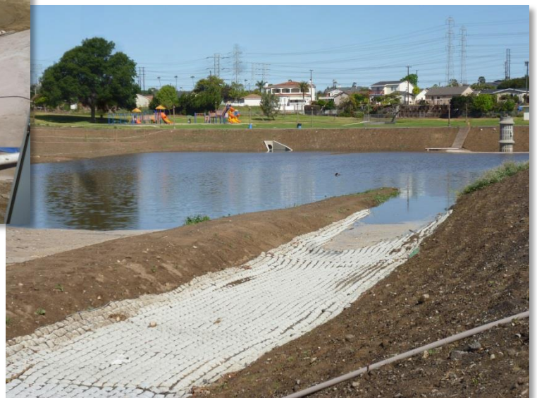
Flexible mat system at Entradero Basin