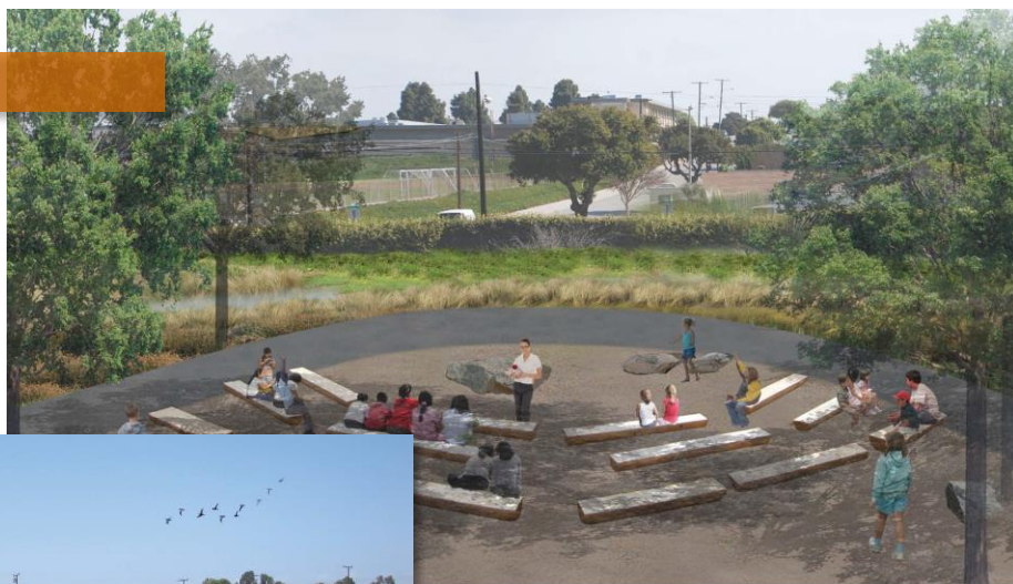
Outdoor Classroom at Henrietta Basin