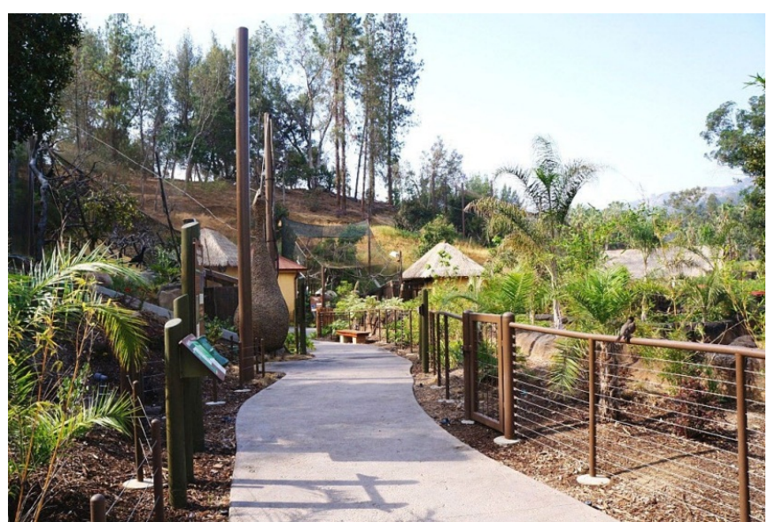
Walkway through the Rainforest