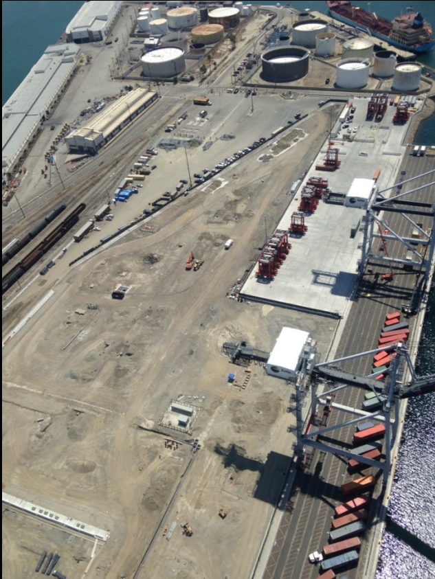
In Construction: 2013-2014