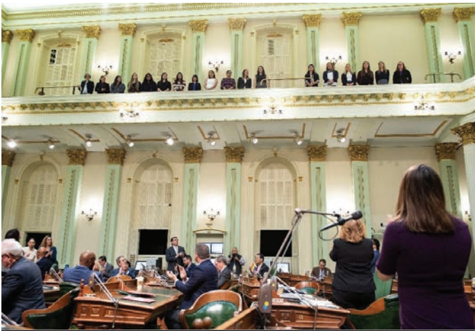
Members receiving a standing ovation from the Assembly after unanimous passage of ACR 153 and ACR 154 resolutions

A video of the entire event can be found at the link below, beginning at the 1hr 17min mark.