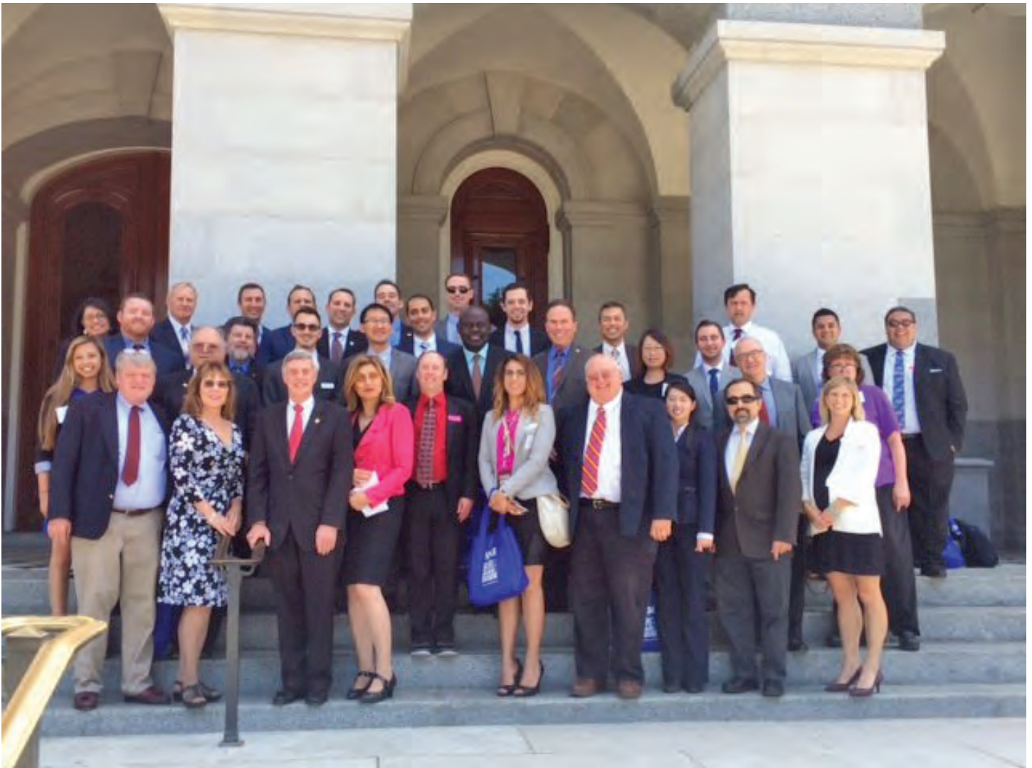
ASCE Region 9 Members Visited the State Capitol on May 18 to Advocate for California Infrastructure

Engineering is about using science to find creative and practical solutions to problems. This can include providing thoughtful input to decision makers who are considering how to restore our infrastructure. If you are interested in finding out how to become a voice for infrastructure restoration within your community check out