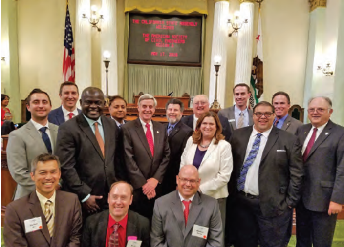
ASCE members visited the Assembly floor during the Region 9 Legislative Advocacy Day