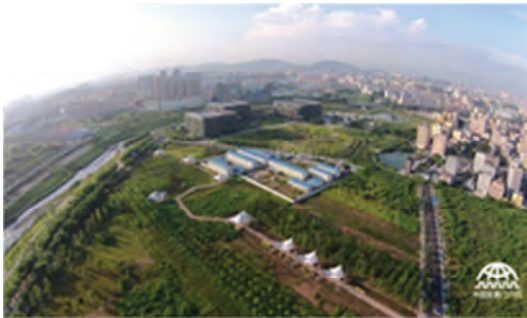
International Low Carbon City