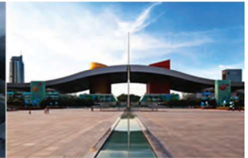
Shenzhen Transportation Center