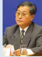
Dr. Guangtao Wang Former Minister, Housing and Urban-Rural Development Ministry, People's Republic of China; Director, Environment and Resources Protection Committee of the 11 th National People's Congress