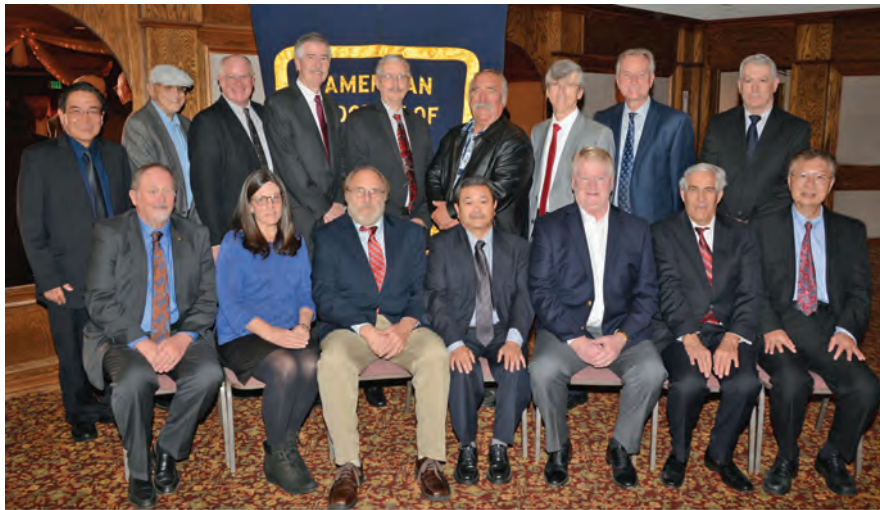
2017 ASCE Los Angeles Section Life Members